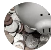
Financial wellness training