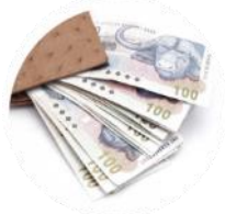
Short-term insurance brokerage